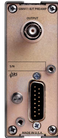
SIM911 rear panel