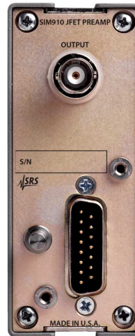
SIM910 rear panel